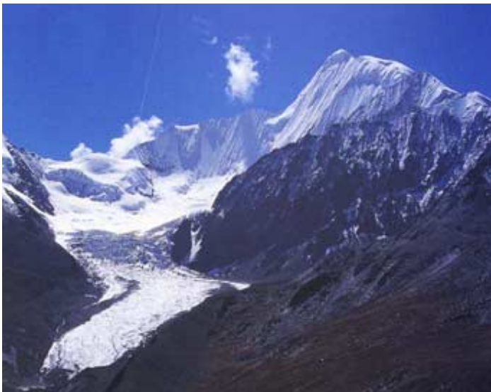
Pic.1 Reddomain (6112 m).

First of all, a brief chronicle of the climbing in Minya Konka massif of Daxue Shan Range in West Sichuan, China is laid down below. All the ascents of Minya Konka (Gongga Shan 7556m), since the first one by Americans in 1932 till the sixth ascent by Japanese in 1997, were made via Northwest Ridge. In 1998, however, powerful Korean party succeeded in the seventh ascent via unclimbed difficult Northeast Ridge that had taken the lives of 12 Japanese climbers in three expeditions. Although several 6000m satellite peaks had been also climbed till 1998, many of outstanding virgin peaks exceeding 6000m remained untouched. One of them was Reddomain (6112m) which was first ascended by the Gakushuin University Alpine Club in 1999 and the following six peaks remain unclimbed till today.